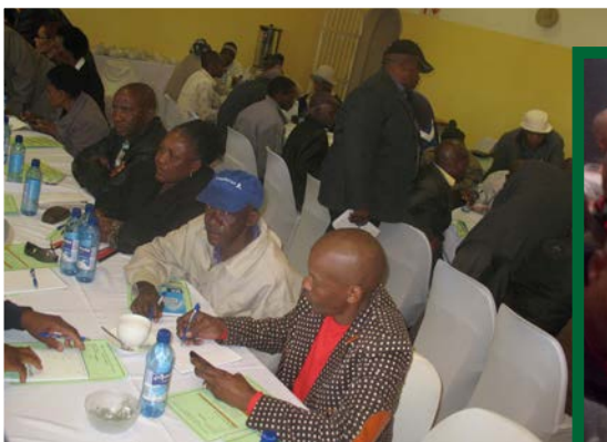
Military Veterans in Mafikeng North West