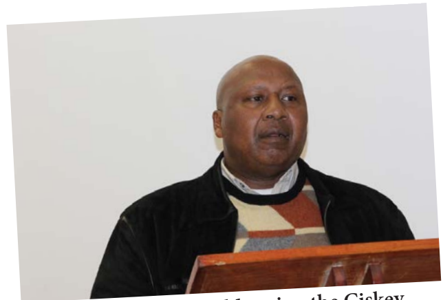
Brig Gen (Ret) Fihla addressing the Ciskei Defence Force members