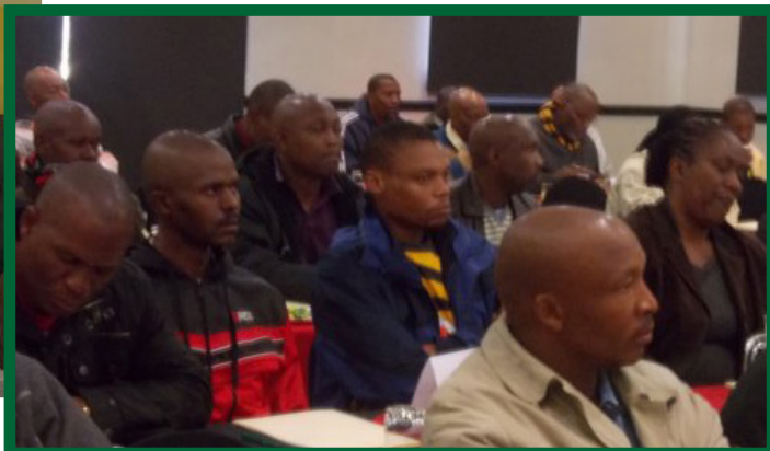
Azanian National Liberation Army Military Veterans Association (AZANLAMVA) members