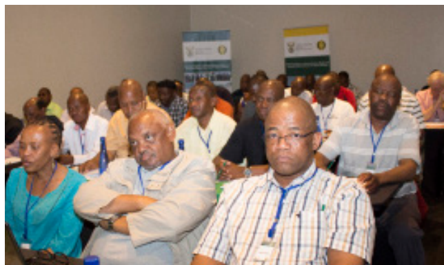
Military Veterans from different associations