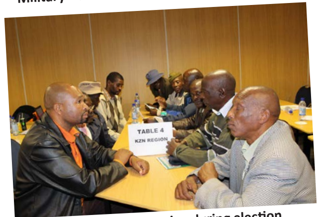
TDFMVA members discussing during election process in Umthata