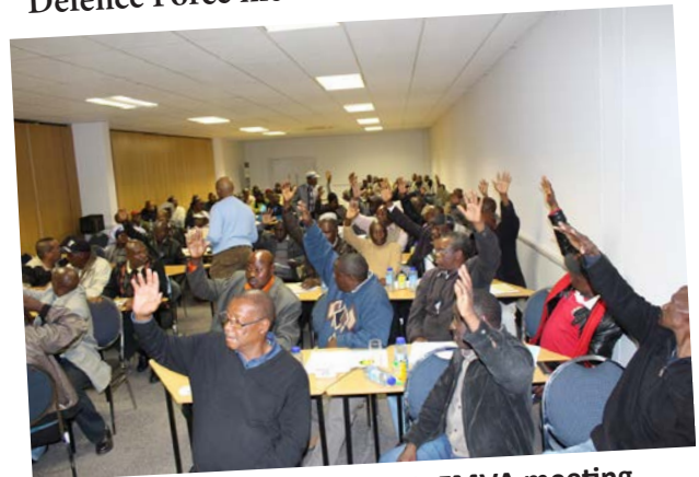
Military Veterans Voting at TDFMVA meeting