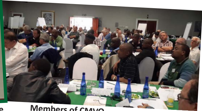
Members of CMVO